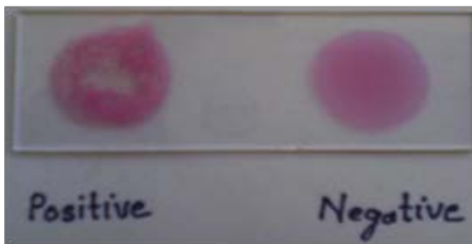
Figure 1: Rose Bengal test

In the present study RBPT and i-ELISA used for detection of brucella antibodies in sheep sera. Out of 1373 sera tested, 94 (6.84 %) and 66 (4.80 %) were found to be positive for Brucella antibodies by RBPT and i-ELISA, respectively (Figure 1 and Figure 2). Similarly, Lone et al., (2013) reported 6.50% and Hassanain and Ahmed (2012) reported 5.71% seroprevalence in sheep by RBPT. Panchasara et al. (2015) recorded more or less similar overall seroprevalence was 10.66%, 10.29% and 9.38% by RBPT, STAT and i ELISA, respectively in North Gujarat. Tayshete (2001) detected 4.0% seroprevalence in north Gujarat by i-ELISA.