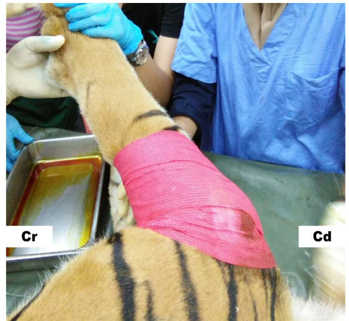
Figure 4: The elbow joint was bandaged with gauze soaked with povidone iodine, cotton and water resistant compressing bandage.

During the post-operative management, 10 mg/kg of Amoxicillin (PO), SID was given for 10 days as a prophylactic antibiotic to prevent secondary bacterial infection, iodine spray BID was administered as anti-septic solution for wound care and finally Papase (PO), SID for 7 days as NSAID to reduce further inflammation. The elbow joint was then bandaged with gauze, soaked with povidone iodine, cotton and water resistant compression wrap (Figure 4). The problem has resolved and there is no further recurrence of hygroma in this case.