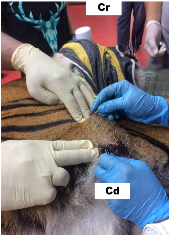
Figure 3: Second incision was made at the cranial part of the hygroma to ensure the entire sac is fully drained and easier to flush to remove all debris accumulated inside the cavity.