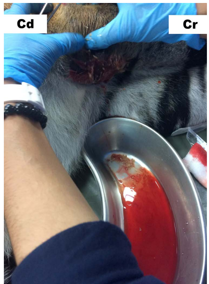
Figure 2: Incision (1.5 cm) at caudo-ventral part of elbow and drained 15 ml of serosanguineous fluid with blood.