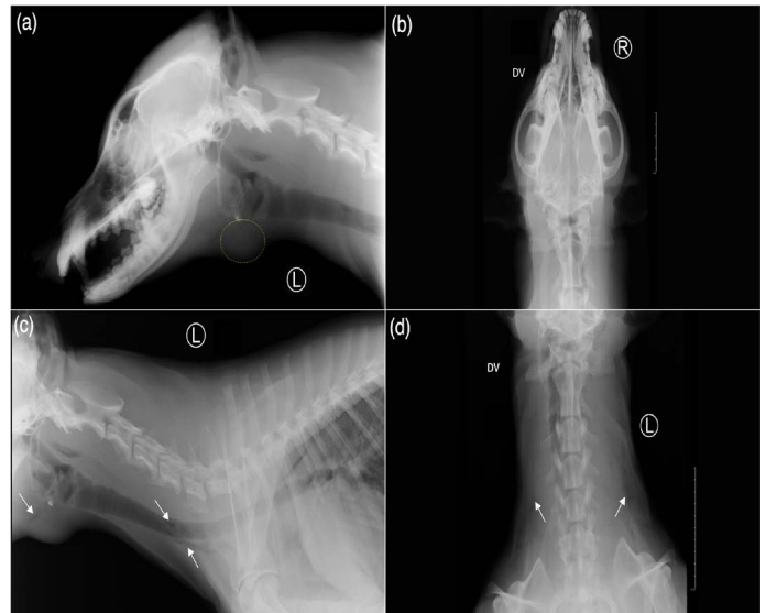
Figure 1: Radiographic views of the skull: left lateral (a) and dorsoventral (b), and the neck: left lateral (c) and dorsoventral (d) of the reported case. (a) There is presence of a rounded soft tissue or fluid opacity structure with distinct margin just ventral to the larynx (marked with yellow dotted circle). (c,d) On both left lateral and dorsoventral radiographs of the neck, multiple small rounded air opacities coalescing to linear gas opacities (white arrows), noticed in bilateral fascial planes of the neck indicating cervical soft tissues emphysema.

Computed tomography (CT) scan of the neck region was acquired through cone beam CT scanner (Fidex; Animage LLC., Pleasanton, CA, USA) at 0.45-mm slice thickness. The anaesthesia was co-induced using 5mg/kg IV propofol and 0.2mg/kg IV midazolam administered to effect and