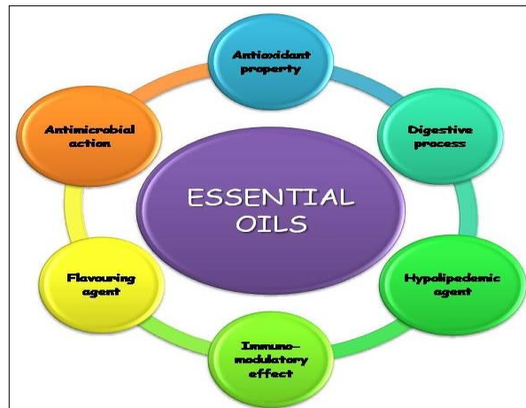
Figure 2: Benefits of essential oils

The EOs have wide range of activities in system like anti-bacterial, antioxidant, digestive stimulant, hypolipidemic, growth promoter, immunomodulator, antimycotic, antiparasitic, antitoxigenic, antiviral and insecticidal. But the most important uses of EOs are reviewed here. Beneficial activities of essential oils are summarized in figure 2