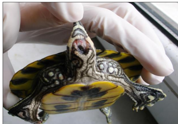
Figure 2: Postoperative view of the case