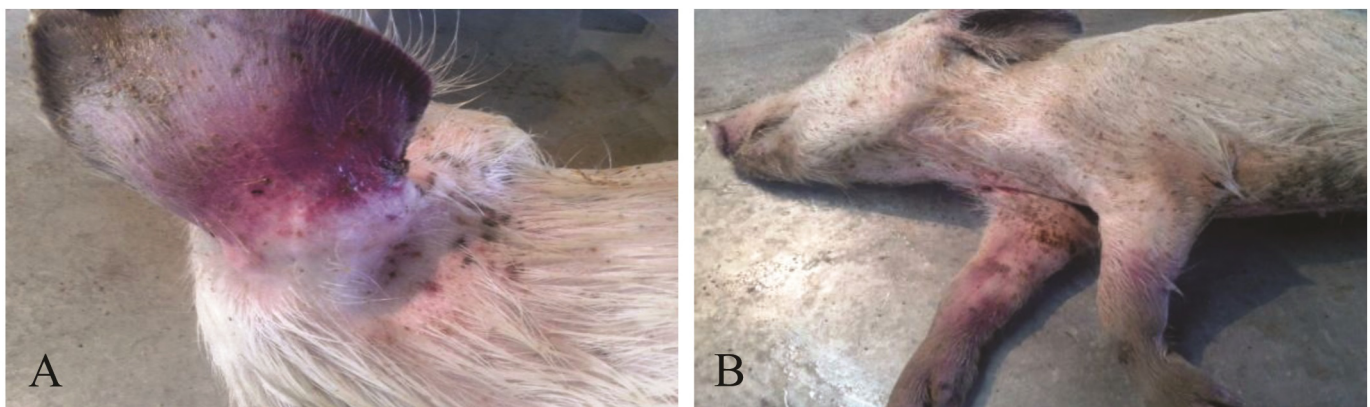
Figure 2: Clinical signs in experimentally infected piglets: A. Cyanosis of ear base; B. Dead carcass with cyanotic discoloration at inner side of abdomen and legs