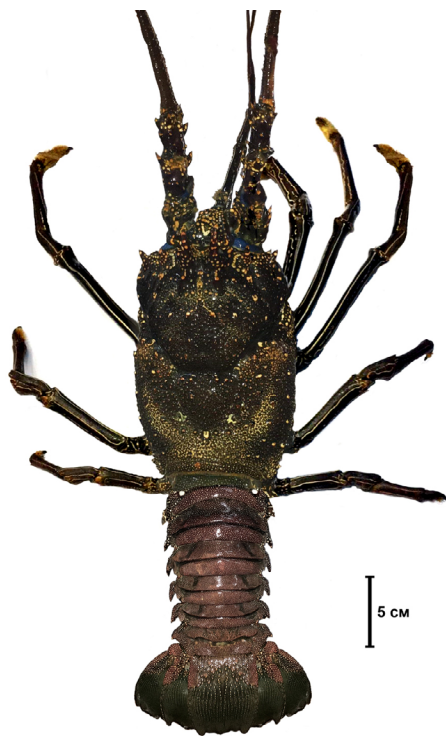
Supplementary Fig. 1. Specimen of Panulirus penicillatus collected from south region of Oman (male: TL 42.0 cm, CL 17.2 cm).

3 Marine Science and Fisheries Centre, Ministry of Agriculture and Fisheries Wealth, Muscat 113, Sultanate of Oman