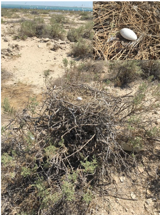
Supplementary Fig. 1. The nest was built above a halophytic shrub, about 70 cm from the ground.

3 Department of Biology, Faculty of Science, Taif University, PO Box 11099, Taif 21944, Saudi Arabia.