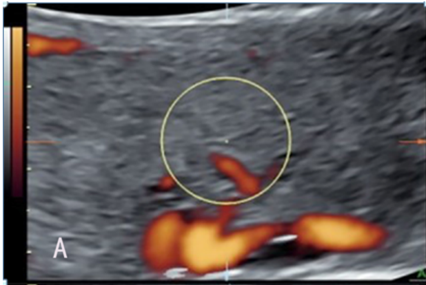
Supplementary Fig. 1. 3D-CPA imaging of fetal kidney.

Obstetrics and Gynecology Department, The Third People's Hospital of Lixia District of Jinan City, Jinan, 2500000, China