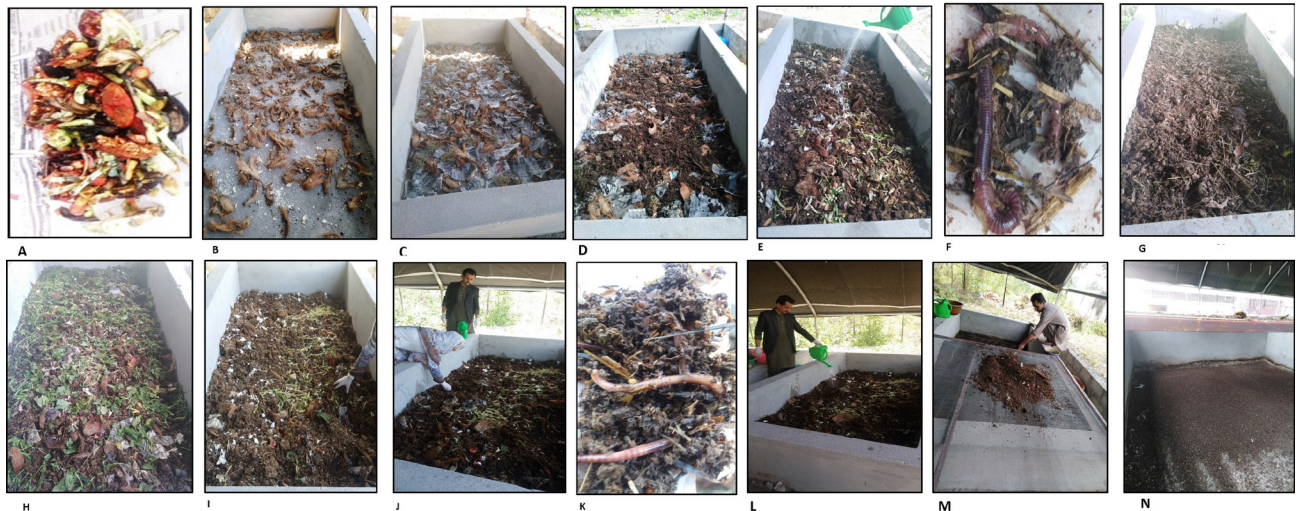
Fig. 1. Vermi-bed preparation and vermi-composting process. (A) Pre-digested fruit and vegetable waste, (B-C) Bedding preparation, (D) Introduction of worms, (E) Introduction of fruit and vegetable waste, (F) Mature clitellate worm, (G) Mixing of material, (H) Introduction of spinach as green material, (I-J) Processing of vermi-compost, (K) Worm movements, (L) Watering, (M-N) Sieving of vermicompost.

4 Land Resources Research Institute, Pakistan Agricultural Research Council, Islamabad, Pakistan